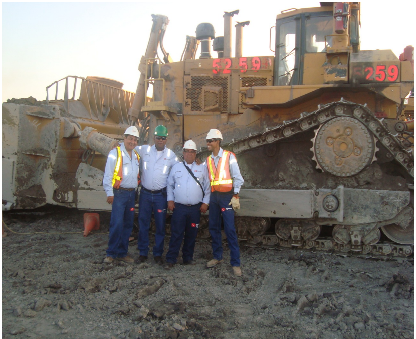
Puerto Drummond workers during their training in Pribbenow Mine.

As part of the training and learning process our workers receive, a total of nine (9) employees (3 from each group) from the Yard area at Puerto Drummond had the chance to visit Pribbenow Mine's facilities to receive training in safe work techniques and procedures in bulldozer operation. They also took an "Educator of Educators" course in order to become evaluators and multipliers in their work areas in the short term.