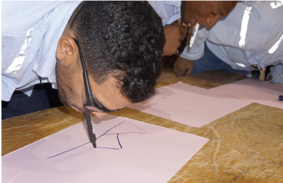
Employees drew landscapes with their mouths and said how difficult it would be to live without hands.

Through a variety of fun activities like blowing up balloons with one hand, drawing landscapes with their mouths and dressing a baby doll with their non-dominant hand, employees from the Maintenance Center department at the Pribbenow mine have experienced the “Hey, use your head before you use your hands!” campaign for 9 months, making employees and their families appreciate these valuable extremities even more. This campaign is intended to eliminate these type of accidents among this group of workers.