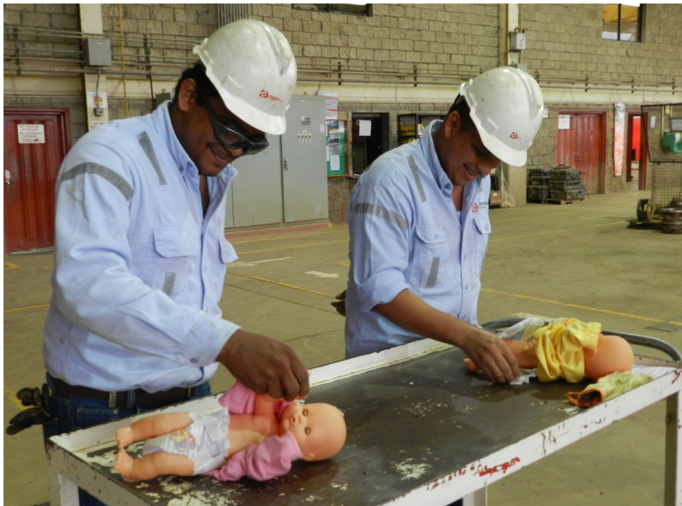
Dynamic “Dress the baby with one hand.”

Through a variety of fun activities like blowing up balloons with one hand, drawing landscapes with their mouths and dressing a baby doll with their non-dominant hand, employees from the Maintenance Center department at the Pribbenow mine have experienced the “Hey, use your head before you use your hands!” campaign for 9 months, making employees and their families appreciate these valuable extremities even more. This campaign is intended to eliminate these type of accidents among this group of workers.