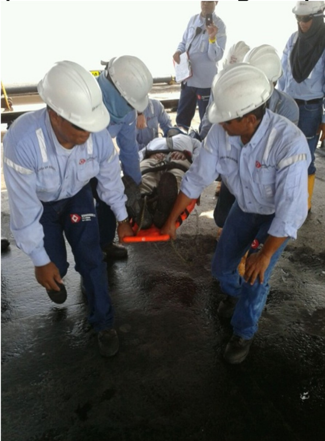
During the Level I Drill in the Ship Loader area.

Safe actions and procedures are a constant in each of Drummond Ltd.'s areas; in order to ensure this, through the Industrial Safety Department, the company seeks to make each employee aware of the actions they take as part of their role and area; it is the same sense of safety that motivates the company to make sure its employees are prepared to respond to or help others in the event of any emergencies that may arise.