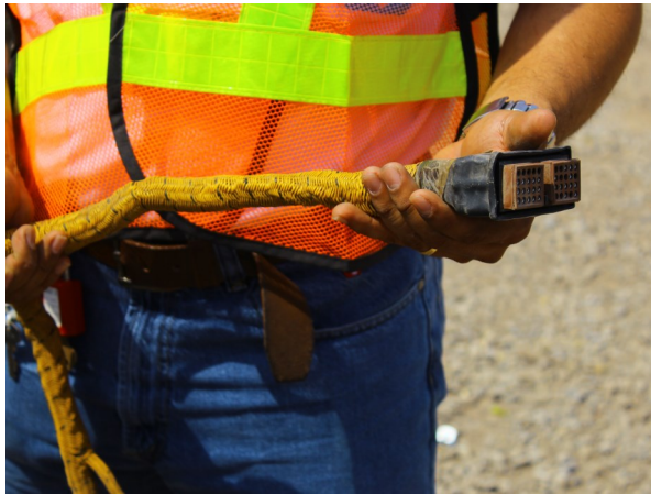
Pictured: Harness with damaged cables. The manual gives instructions for repairing this type of damage.

*Construction and development of new technology facilitates the area's work, making it safer for the operators handling the machines.