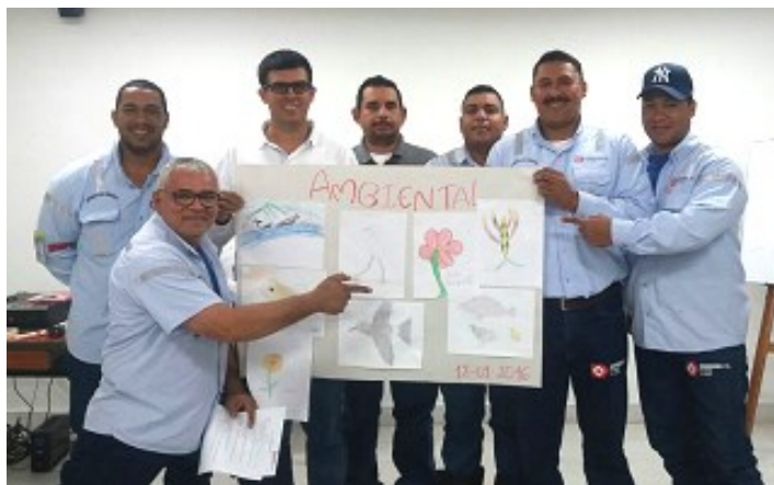
Employees draw their versions of the plants and wildlife they must protect.

Drummond encourages employees to be familiar with its environmental policies, especially those related to the protection of plants and wildlife at its facilities, both at the mine and the port. This is part of maintaining a balanced and sustainable ecosystem inside and around its operations, which will benefit of the communities in the future.