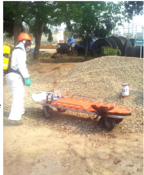
To check how well it works, the stretcher has been used during emergency simulations.