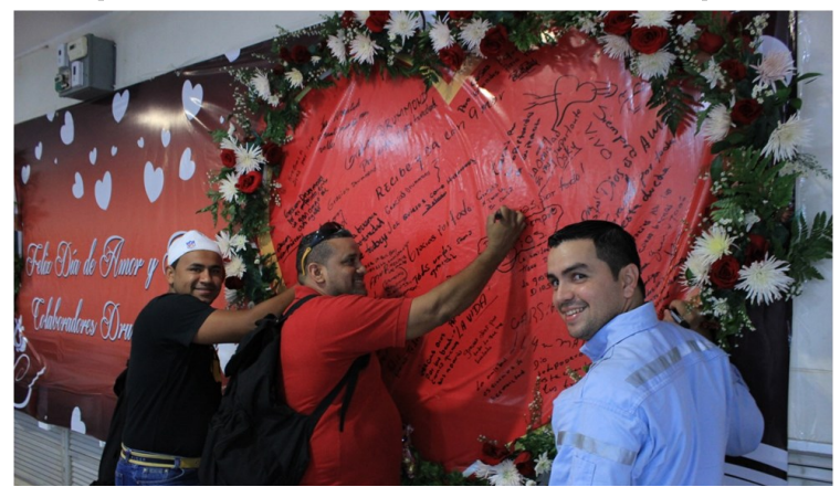
The employees expressed thank you messages and team spirit towards the company.