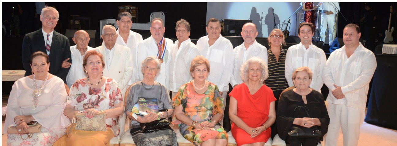
*Special recognition to former Governors that have been an important part of the development and history of the Department of Cesar in its 50 years.